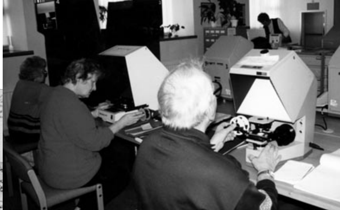
Visitors using microfilm readers