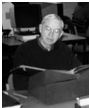
The public searchroom

Enquiries should preferably be made in writing or by e-mail. In response to enquiries staff can sometimes make a brief examination of documents if given specific and accurate base information, but are unable to engage in lengthy research. Staff can give no legal advice. A list of record agents is available on application.