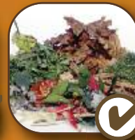
Garden prunings & weeds