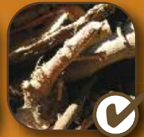
Small branches (no more than 5cm across)