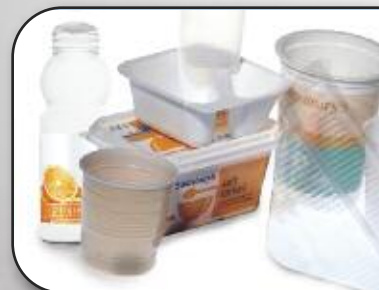
NEW Household plastic packaging