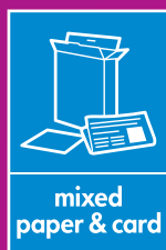
mixed paper & card