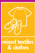
mixed textiles & clothes