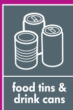
food tins & drink cans