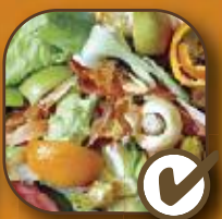
Fruit/vegetable peelings & cores