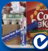
Flattened cardboard, cereal and egg boxes