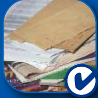
Envelopes, junk mail and paper