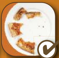
Plate scrapings and any leftovers