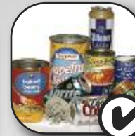
Metal food and drinks cans