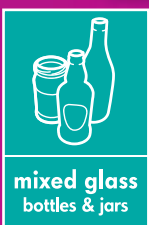
mixed glass bottles & jars