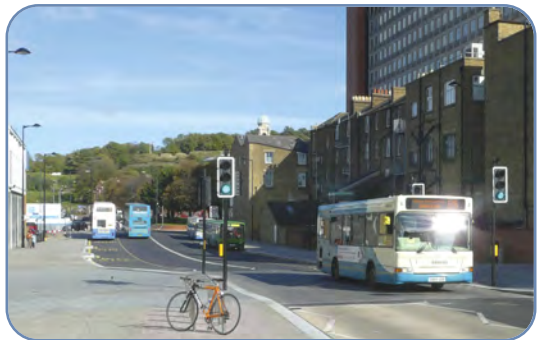
Waterfront Way in Chatham Waterfront Bus Station where coaches can pull up on Stand D19.

This area will be supervised at all times by the bus station staff and coaches that have not pre-booked may be turned away as priority will be given to those that have registered.