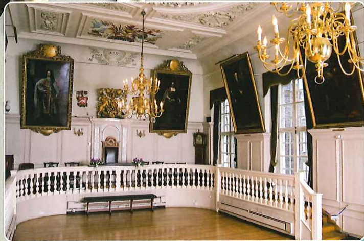
The Court Hall or Guildhall Chamber with its magnificent plaster ceilings, given in 1695 by Admiral Sir Cloudsley Shovell, Member of Parliament for the city of Rochester, was immortalised by Charles Dickens in his novel Great Expectations .