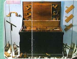
The River Medway Gallery tells the fascinating, inspiring and sometimes tragic stories of the people that lived and worked on the river. Enjoy a realistic trip along the Medway in a tug boat, and the incredible Seaton Tool Chest - the most complete set of 18th century cabinet maker's tools in the world.