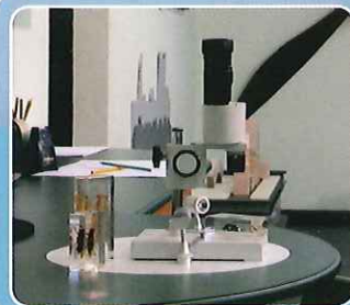
An exciting purpose-built Discovery Zone brings history to life for groups of young people and families. The Museum Education Service offers dynamic and innovative facilitated learning courses for all ages. Exciting hands-on activity workshops can be provided as well as an outreach service for all Medway schools. Contact the museum for more information or to book.