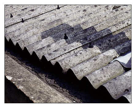
AC sheets used as roofing