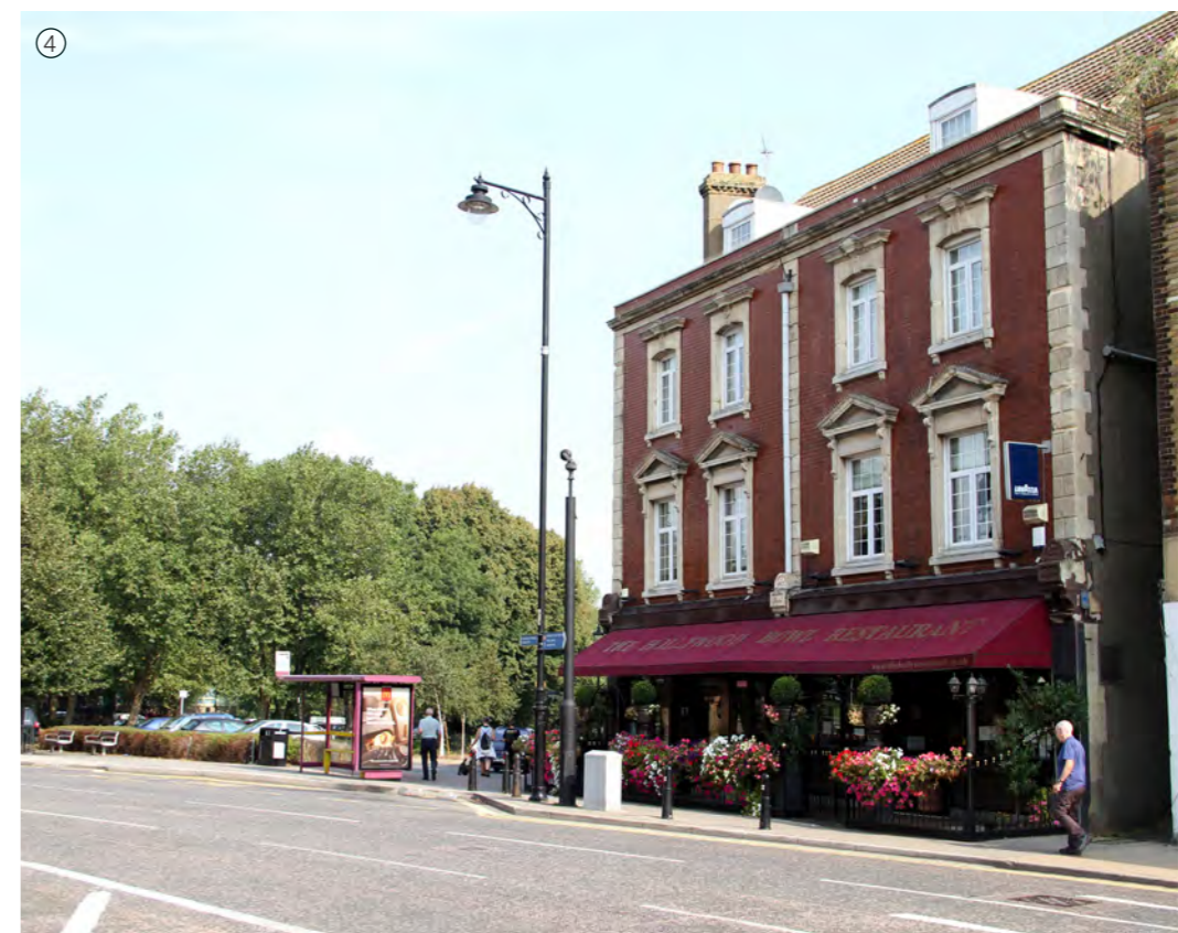
left to right: eastern exit from the pedestrianised area; Sappers Walk; bus stop on Jeffery Street; western gateway at Mill Road and Brompton Road