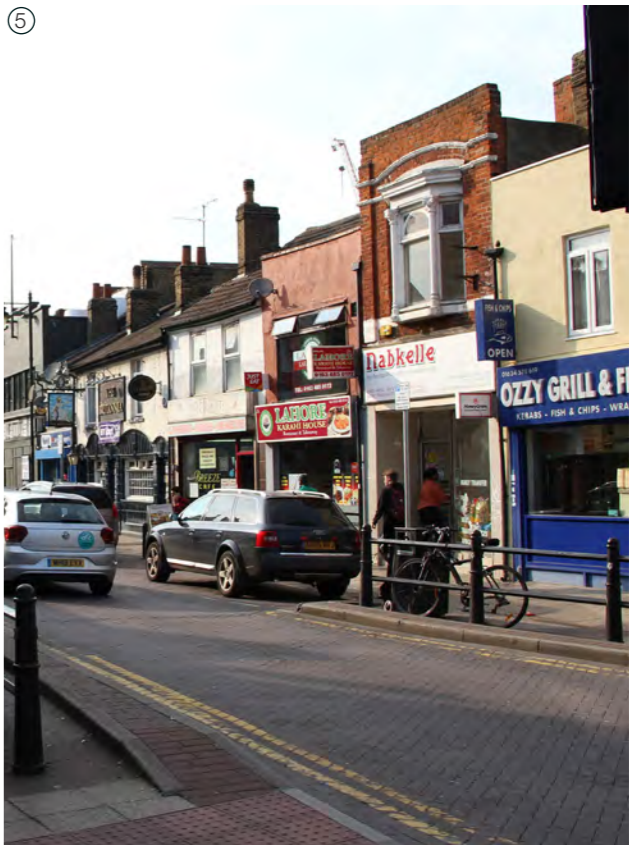
left to right: western gateway at High Street; Britton Farm from Fox Street; shops on High Street; buildings on Green Street; the eastern block at the railway station