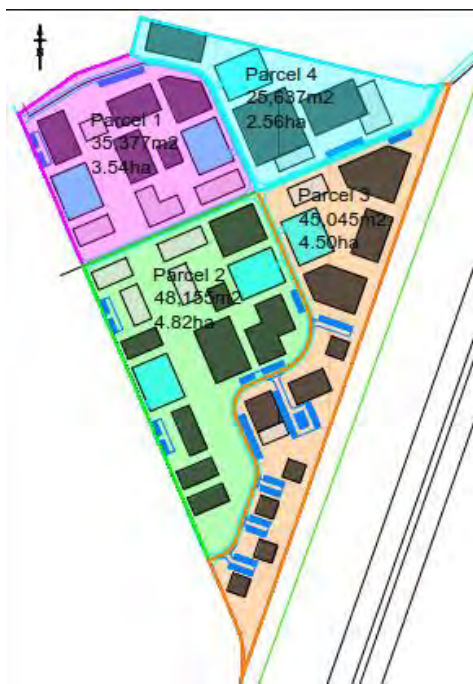
Figure 5.1: Drainage catchments of the northern area

5.2.1. The northern area drainage strategy has been split into four catchments, see Figure 5.1.