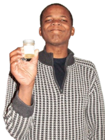
Urine (your wee)