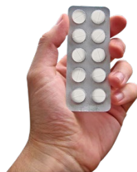
What medication you take

Sometimes they may ask if they can take a sample of your blood.