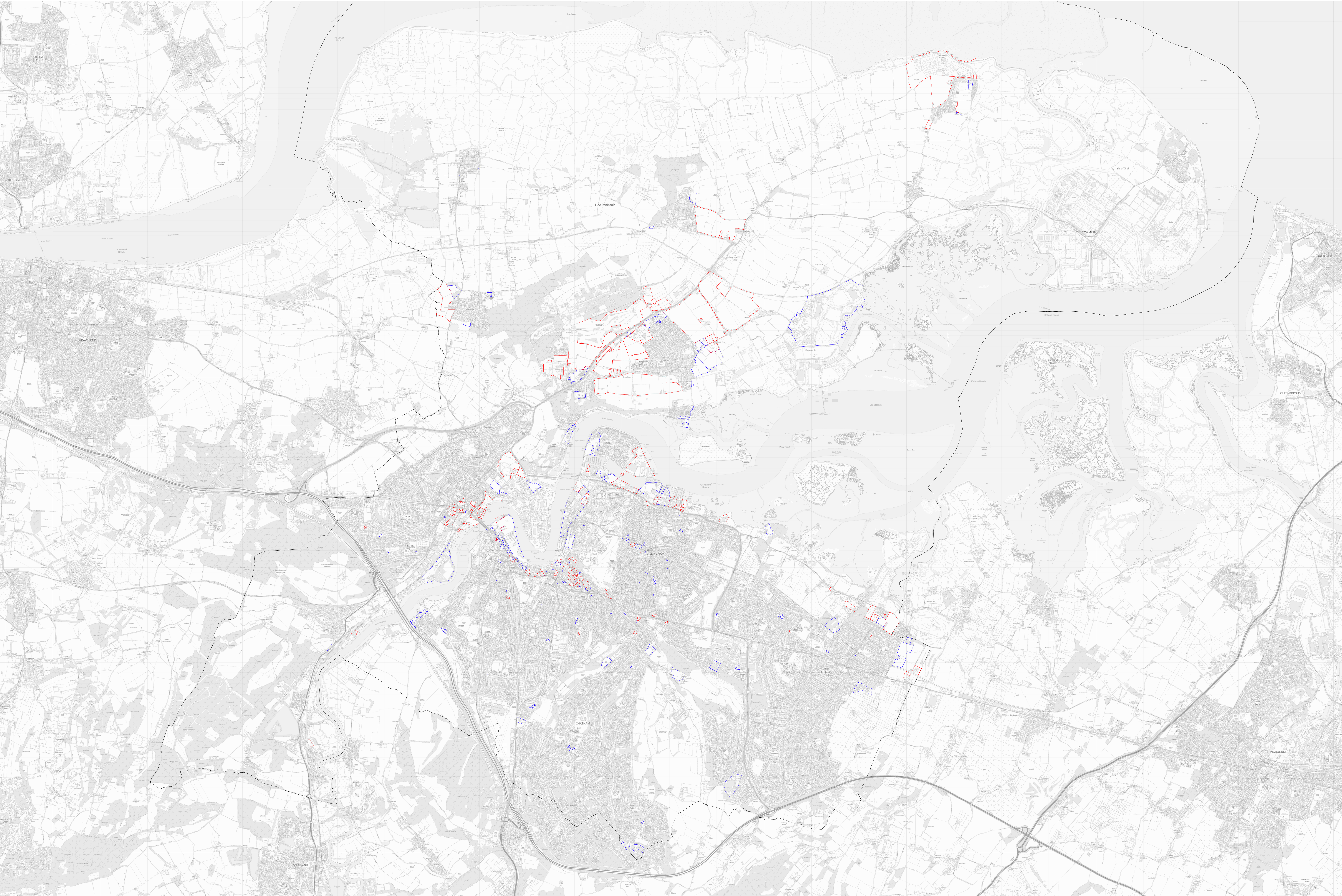
Medway Strategic Land Availability Assessment (SLAA), 2019: Development pipeline sites (residential and commercial land, with planning consent/under construction) IN BLUE OUTLINE

Residential sites meeting SLAA criteria (Suitable, Available and Achievable) IN RED OUTLINE