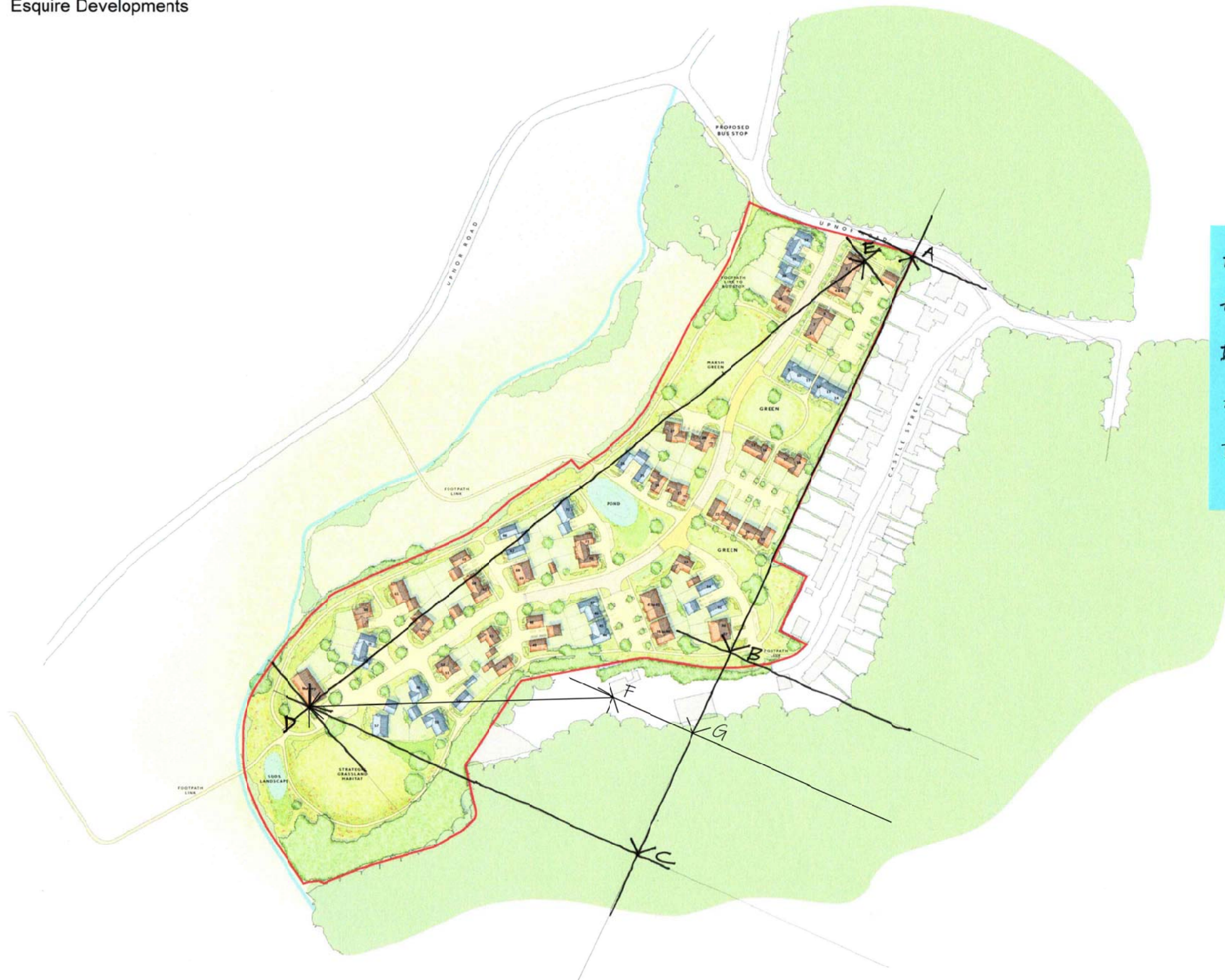
Proposed Residential Development, Land at Upnor Road, Upnor

AB = 240m. AC = 362m. DE = 392m. AG = 290m DF = 166m