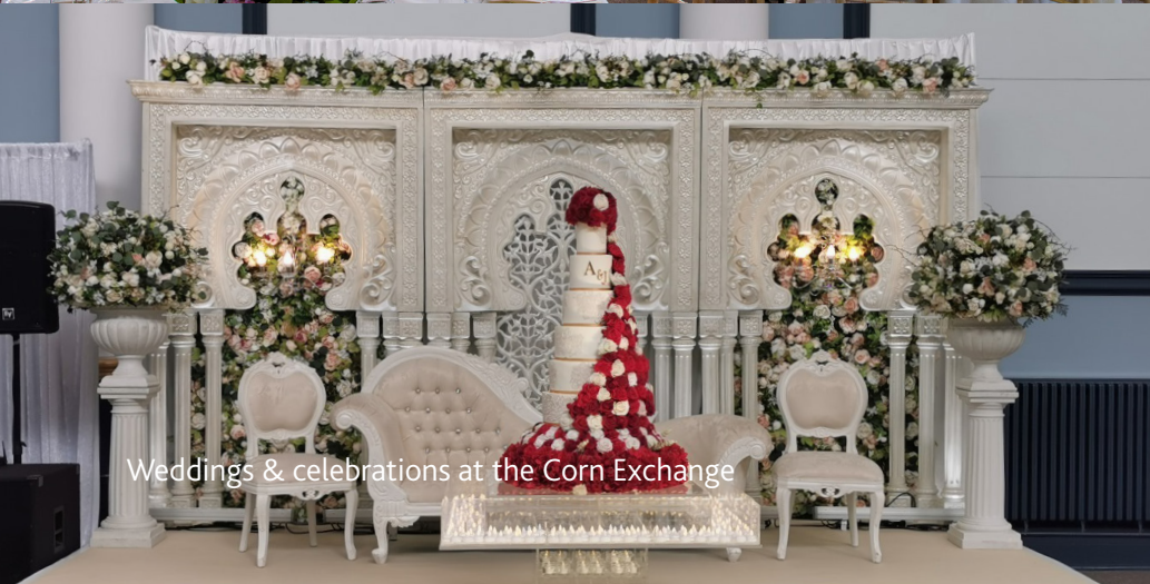
Weddings & celebrations at the Corn Exchange