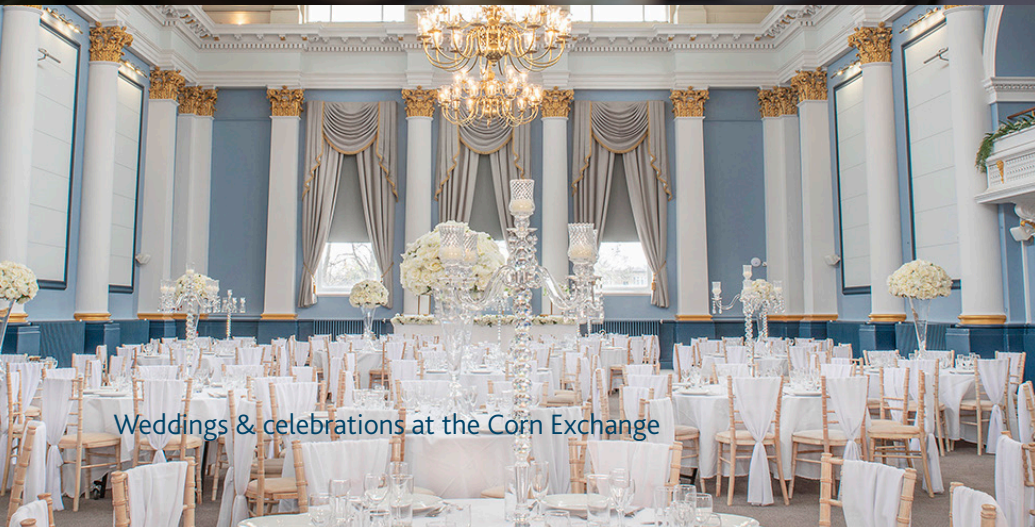
Weddings & celebrations at the Corn Exchange